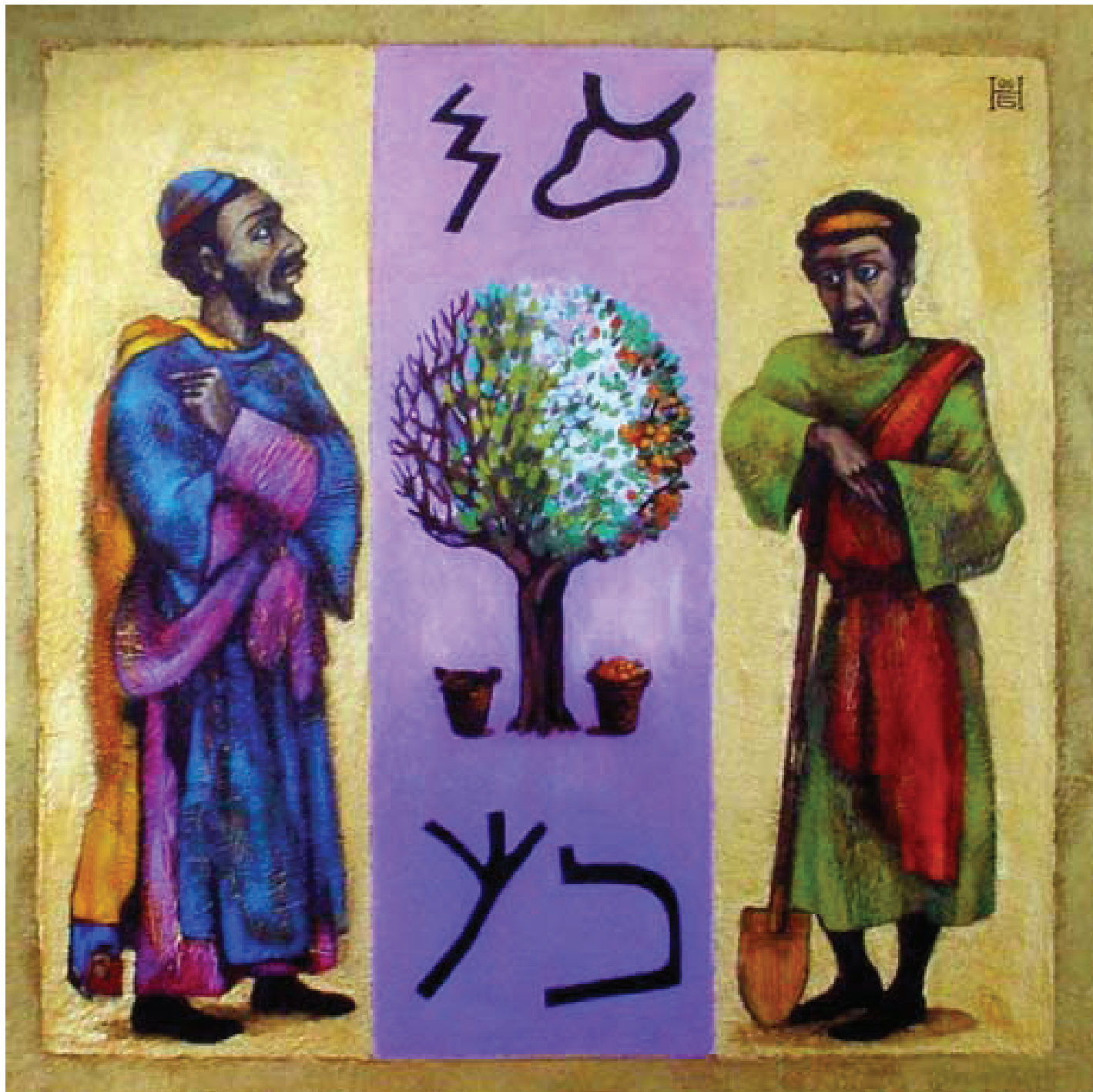
"The Unfruitful Fig Tree and the Servants Duty" by Nelly Bube