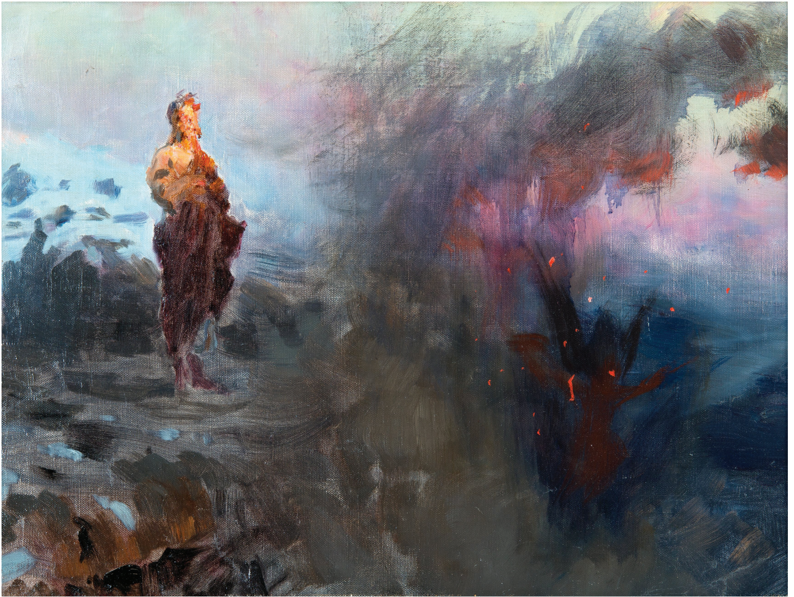
"The Temptation of Christ" by Ilya Repin (1844-1930). Public Domain.