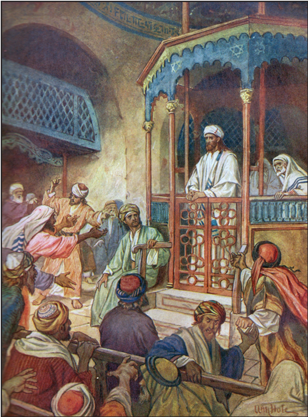
"Jesus Preaches in the Synagogue" by William Brassey Hole