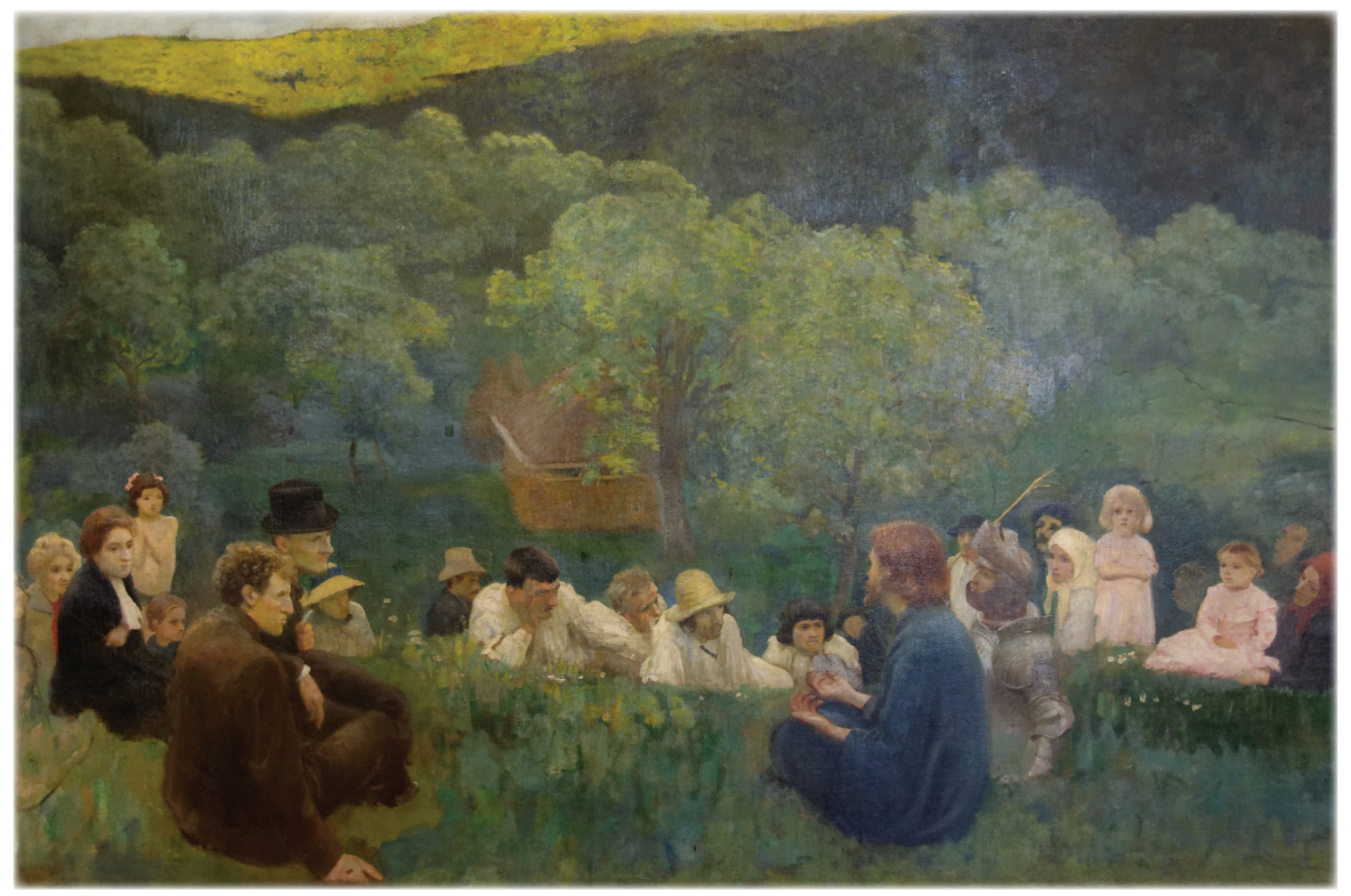
"The Sermon on the Mount" by Károly Ferenczy