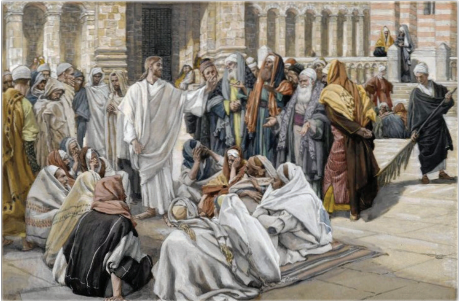
"The Pharisees Question Jesus" by James Tissot

Fifteenth Sunday after Pentecost September 1, 2024 • 8 a.m.