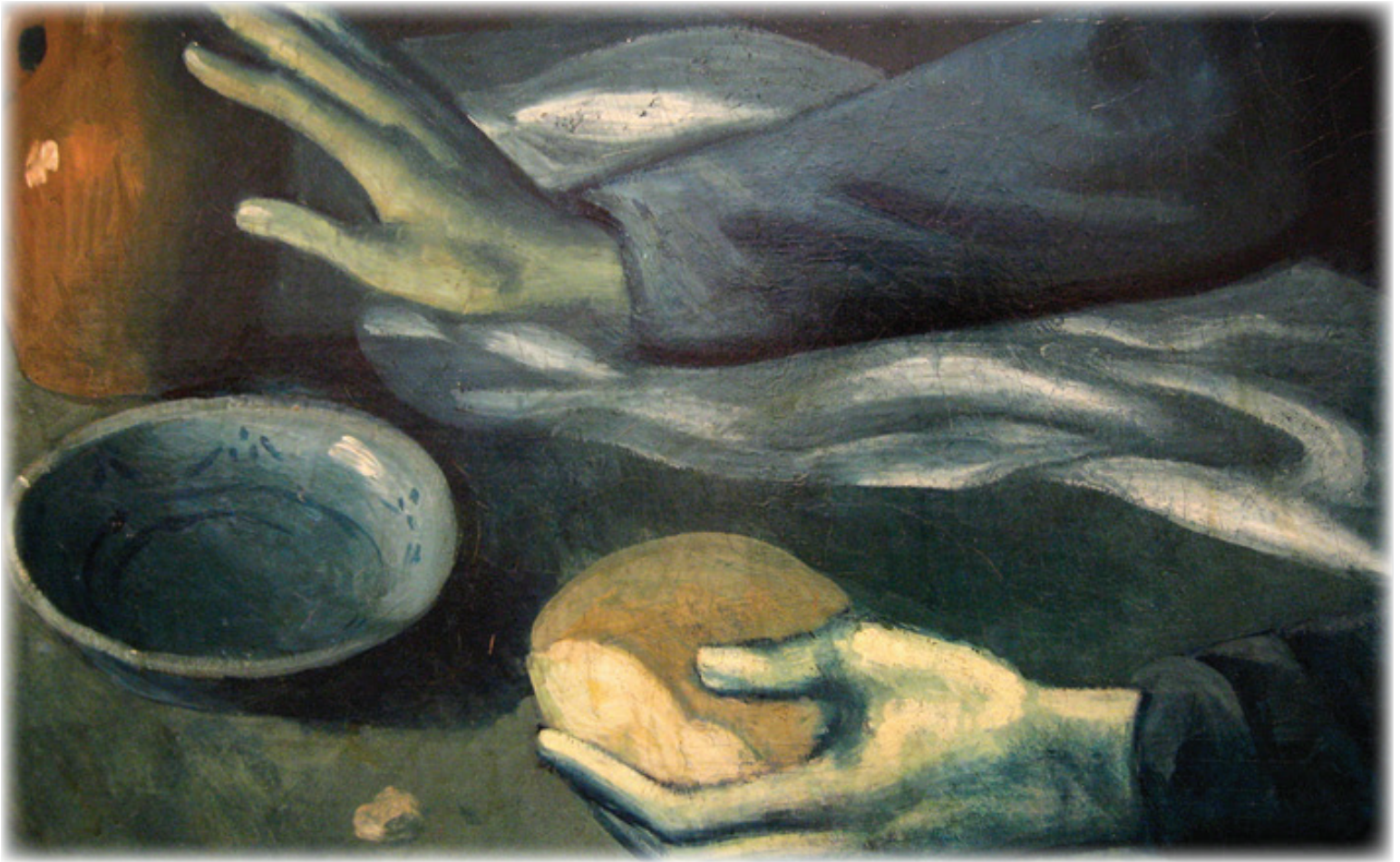
"The Blind Man's Meal" by Pablo Picasso

Thirteenth Sunday after Pentecost August 18, 2024 • 8 a.m.