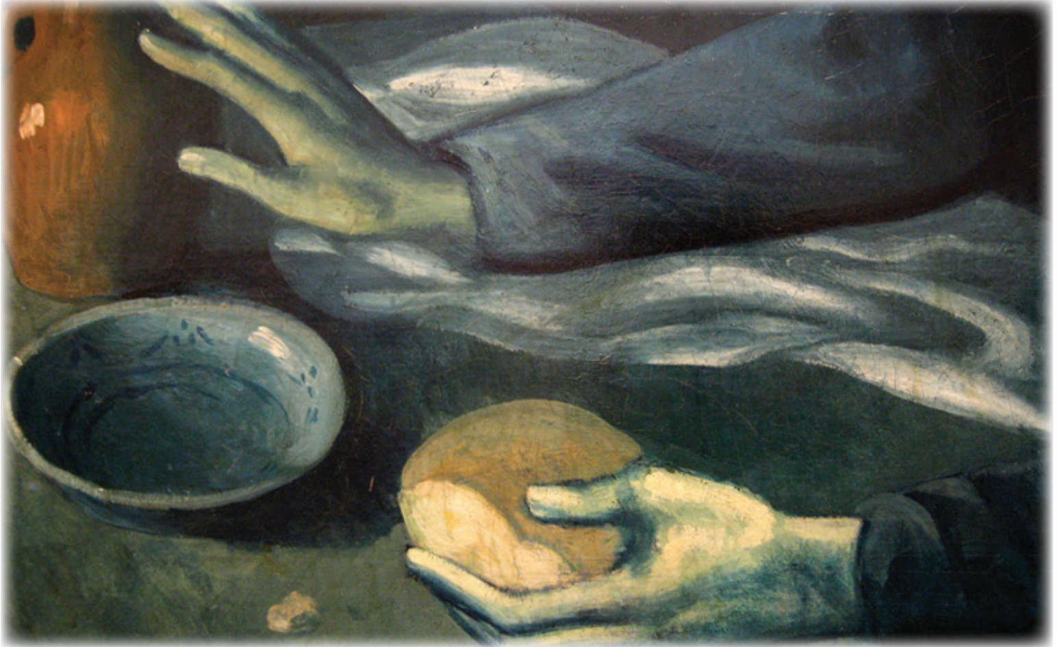
"The Blind Man's Meal" by Pablo Picasso

Thirteenth Sunday after Pentecost August 18, 2024 • 10:30 a.m.