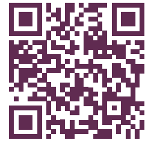
Welcome Card or Email Sign Up

Thank you for joining us for worship today at Grace and Holy Trinity Cathedral. If you are new to the Cathedral, we invite you to fill out our welcome card. Welcome cards are available in the pews or fill out the online form using the QR code.