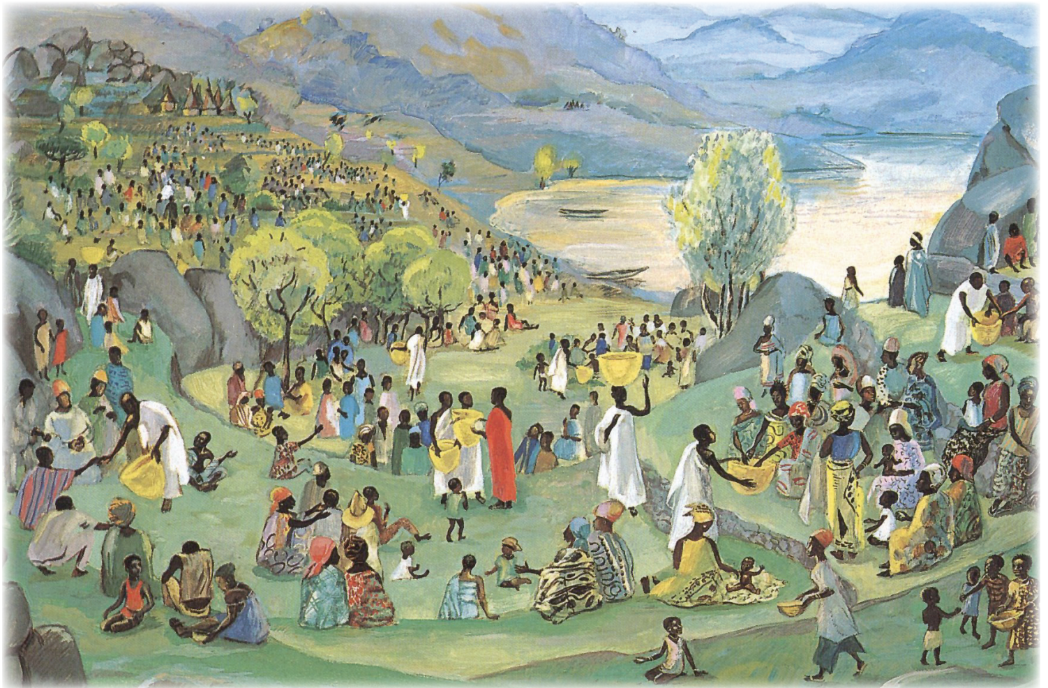
"Jesus multiplies the loaves and fish" by Jesus Mafa by a Christian community in Cameroon, Africa

The Tenth Sunday after Pentecost July 28, 2024 • 8 a.m.