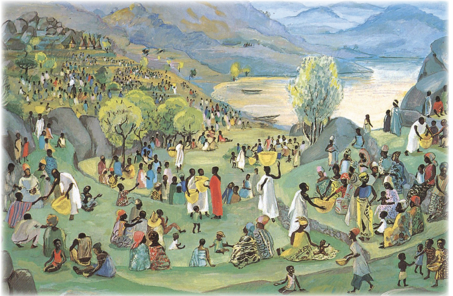
"Jesus multiplies the loaves and fish" by Jesus Mafa by a Christian community in Cameroon, Africa