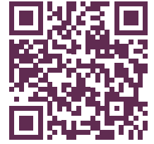
Welcome Card or Email Sign Up

Thank you for joining us for worship today at Grace and Holy Trinity Cathedral. If you are new to the Cathedral, we invite you to fill out our welcome card. Welcome cards are available in the pews or fill out the online form using the QR code.