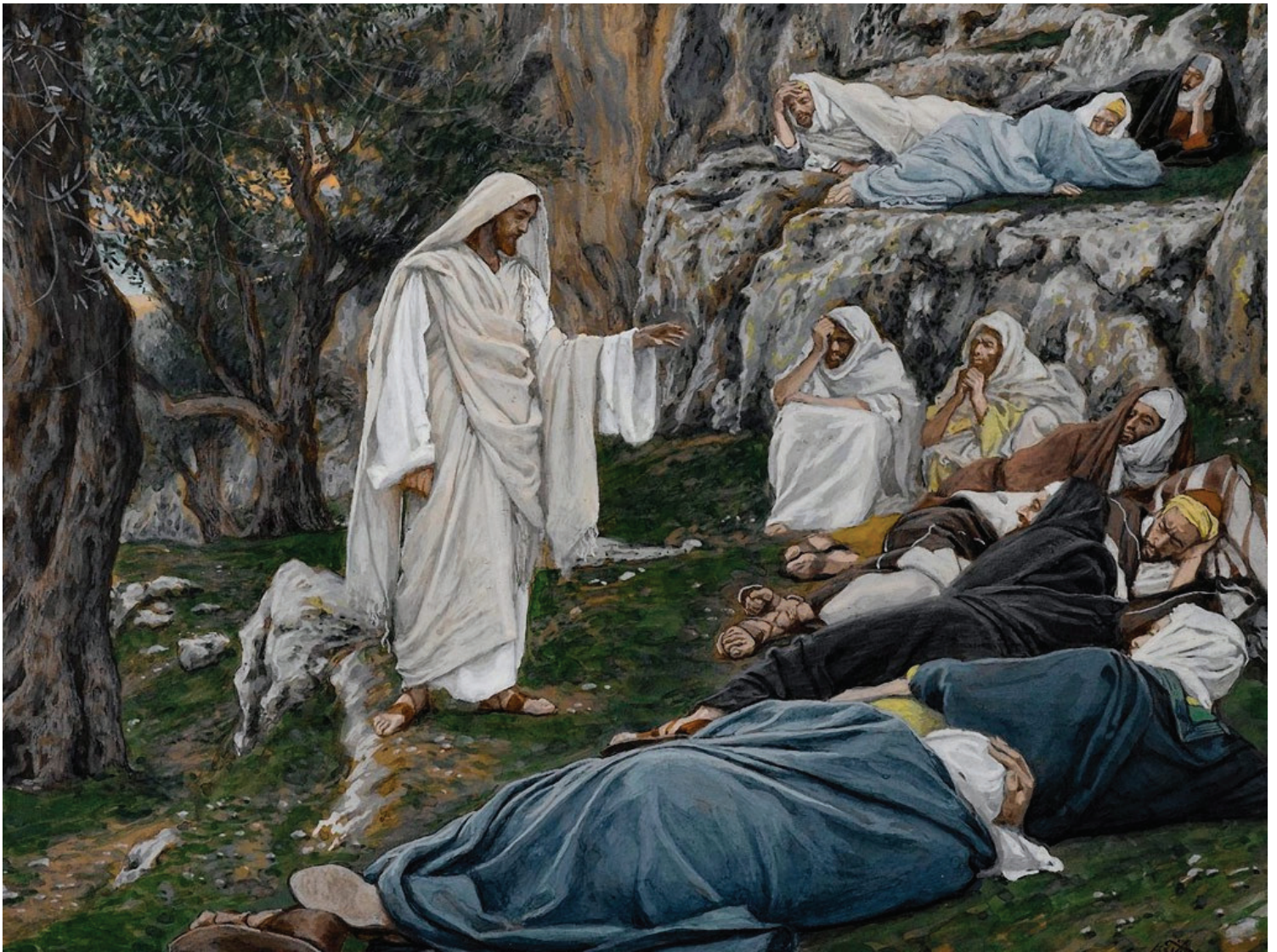
"Jesus Commands the Apostles to Rest" by James Tissot

The Ninth Sunday after Pentecost July 21, 2024 • 8 a.m.