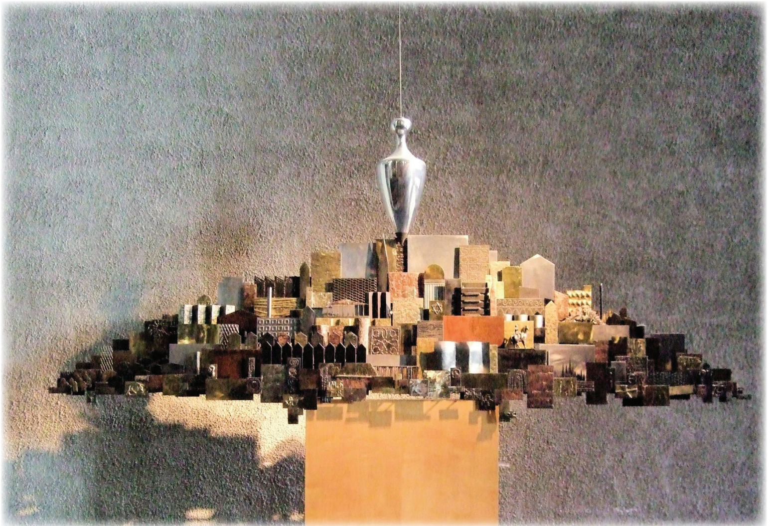
"The Plumb Line and the City" by Clark Fitzgerald

The Eighth Sunday after Pentecost July 14, 2024 • 8 a.m.