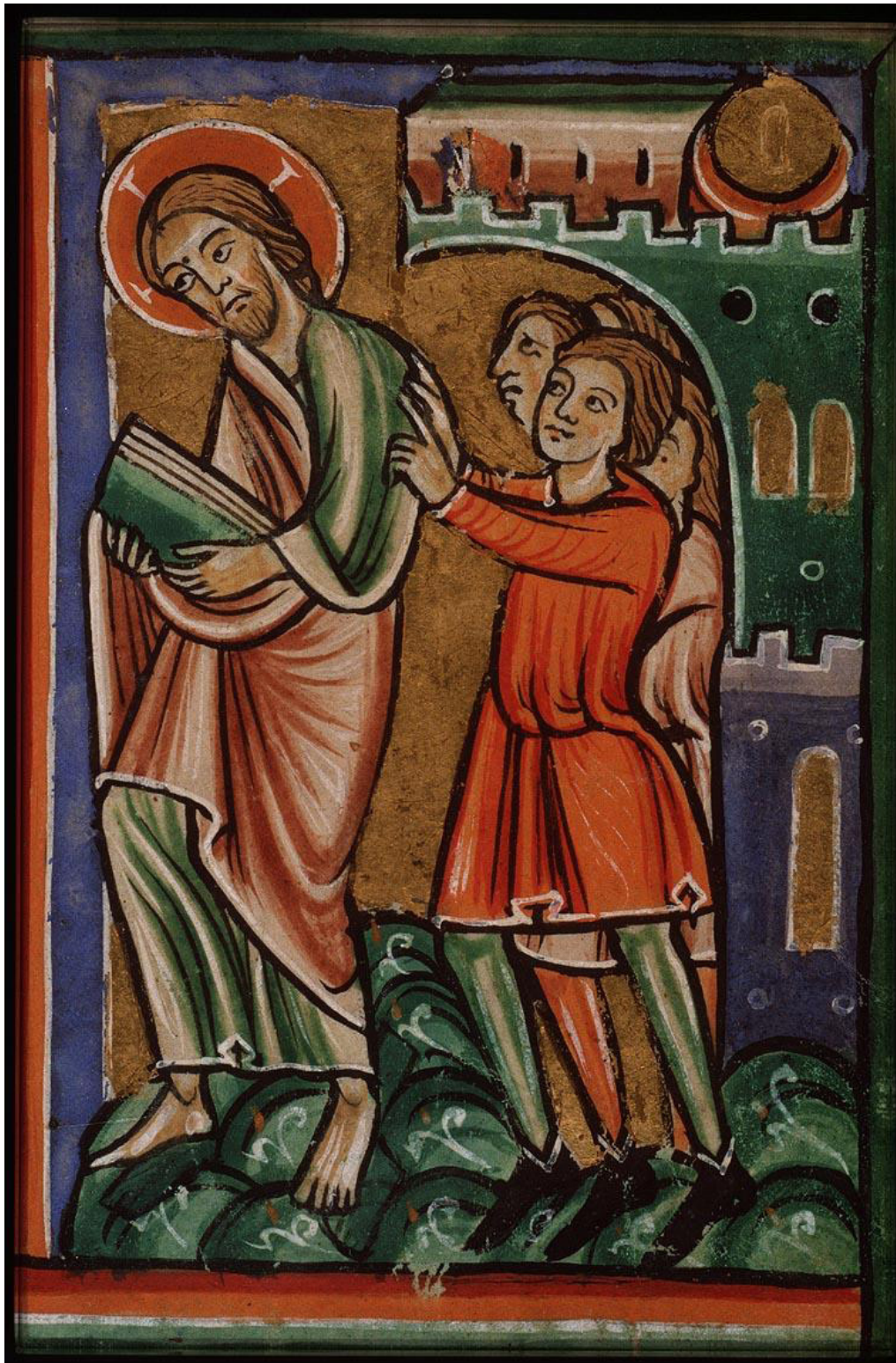
"The Jews Chase Christ Out of the City" from the Illustrated Bible of The Hague

The Seventh Sunday after Pentecost July 7, 2024 • 10:30 a.m.