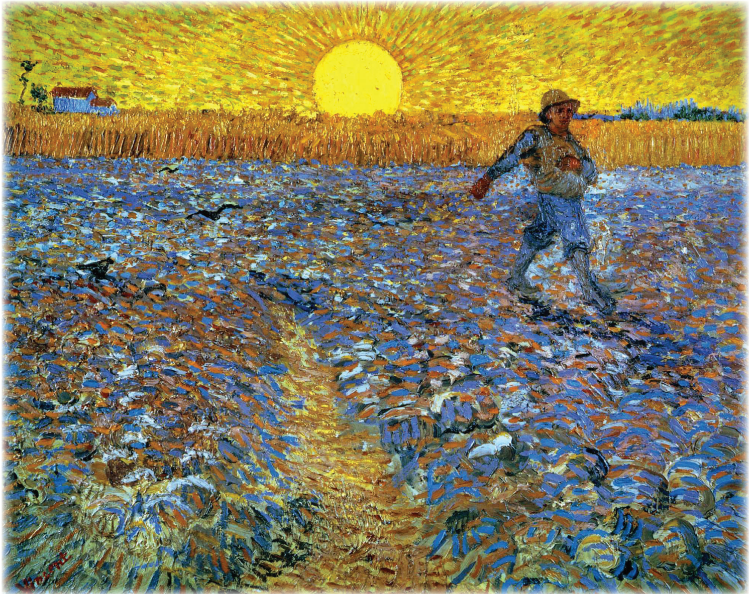
"Sower at Sunset" by Vincent Van Gogh

The Fourth Sunday after Pentecost June 16, 2024 • 8 a.m.