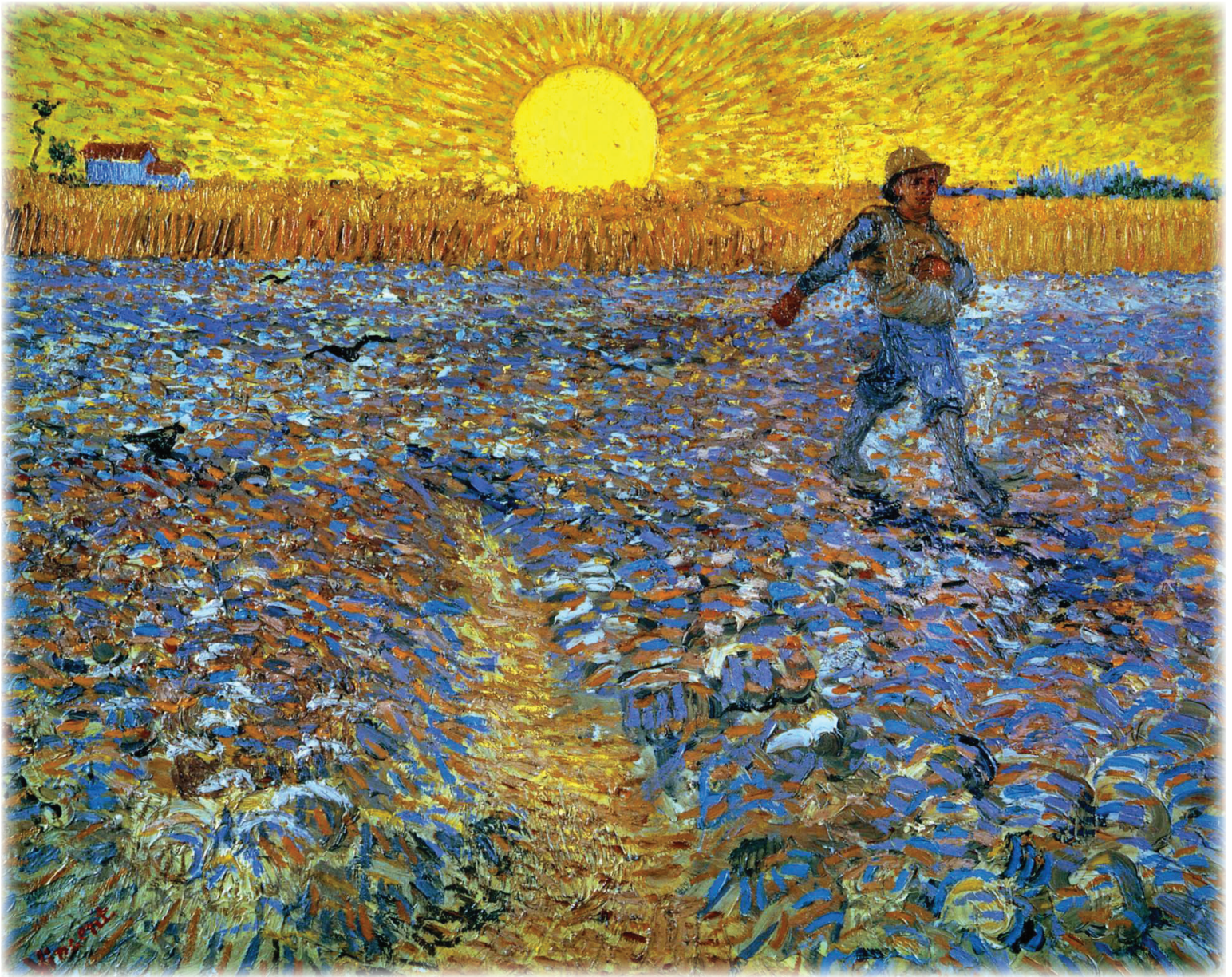
"Sower at Sunset" by Vincent Van Gogh