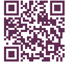
Welcome Card or Email Sign Up

Thank you for joining us for worship today at Grace and Holy Trinity Cathedral. If you are new to the Cathedral, we invite you to fill out our welcome card. Welcome cards are available in the pews or fill out the online form using the QR code.