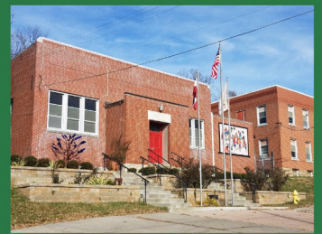
Garrison School, Liberty, MO

You must register by June 5: tinyurl.com/westmojune19