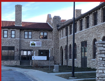
Black Archives of Mid-America