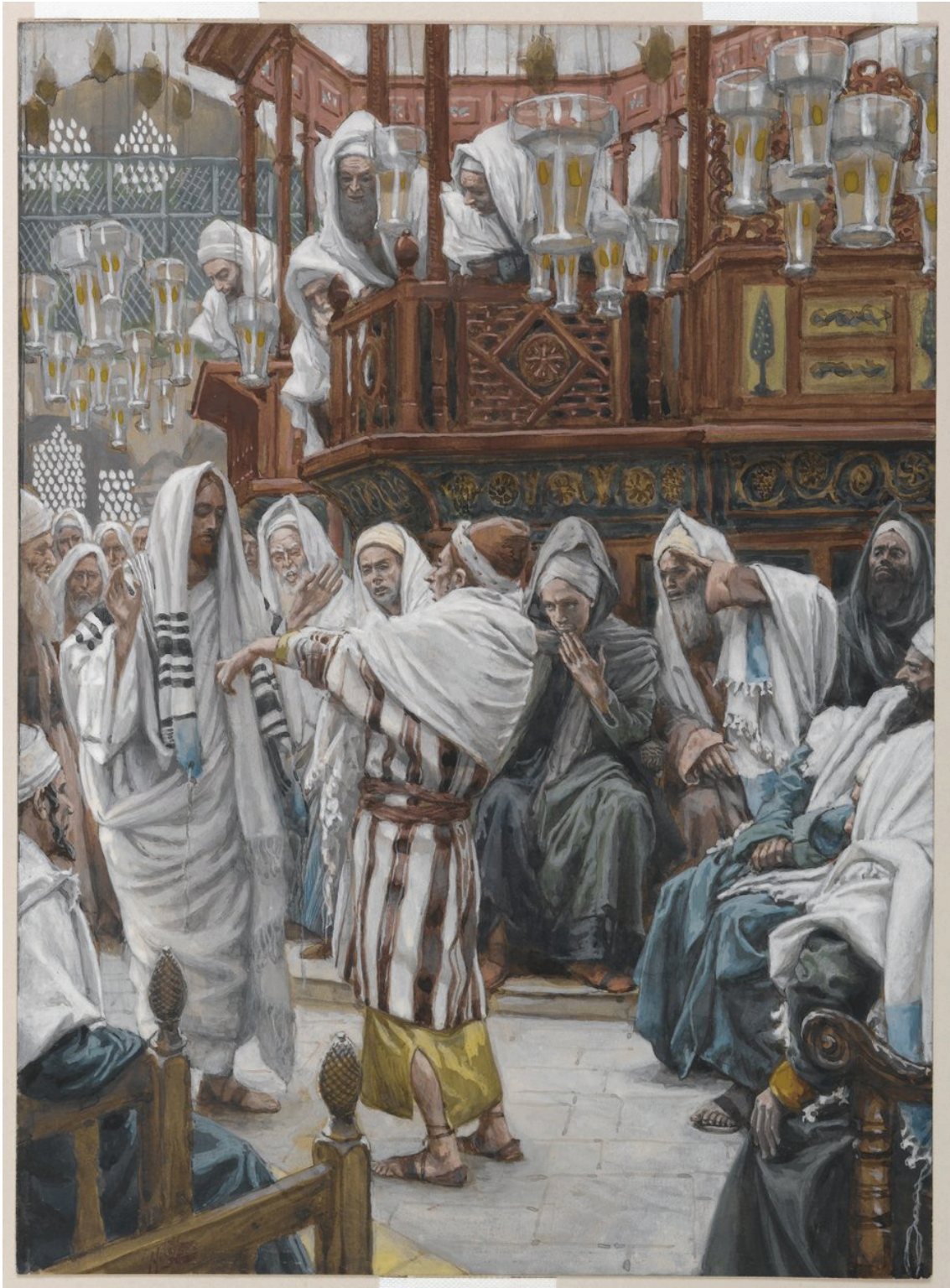
"The Man with the Withered Hand" by James Tissot