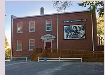
3rd Stop: Garrison School in Liberty 502 N Water St. Liberty, MO 64068 Late lunch back at Founder's Hall following the tour.