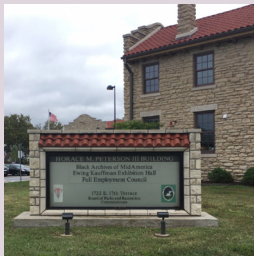
1st Stop: Black Archives of Mid-America Horace M Peterson III Building 1722 East 17th Terrace Kansas City, MO 64108

On Monday, June 10, The Diocese of West Missouri will have a Juneteenth Celebration! People are invited to join us for a tour around Kansas City to visit black historical landmarks. The group will plan to meet at Grace and Holy Trinity Cathedral at 9 a.m., with the bus scheduled to leave at 9:30 a.m. From there, we will stop by three landmarks. Afterwards, the group will return and have a late lunch in Founders' Hall. The cost is $15 per person for lunch. Register at diowestmo.org/join-the-juneteenth-kc-tour-and-other-events .