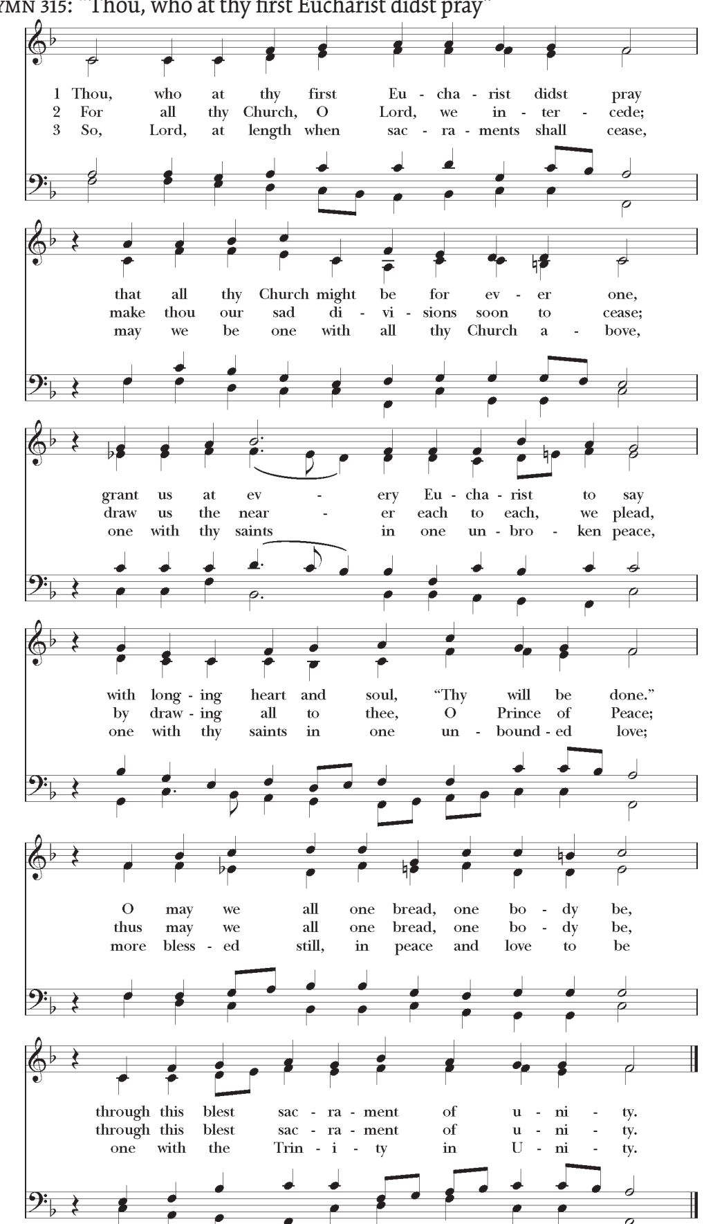
Нумл 315: "Thou, who at thy first Eucharist didst pray"